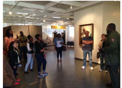
Students with Tuskegee University tour guide enjoying the George Washington Carver Museum.

On Saturday, October 4, 2014, TRiO Student Support Services participants visited Tuskegee University. The university highlighted its history with a tour of the George Washington Carver Museum and "The Oaks," Booker T. Washington's home. The enthusiastic tour guide delivered educational information about the college as the participants walked around campus. The students were astounded to learn that the university is also a National Historic Site. Students then enjoyed lunch on campus and a football game, Tuskegee vs. Fort Valley State University. They were able to interact with Tuskegee's students and fans. Tuskegee University piqued the interest of students to the point where they are eager to return, either as a transfer student or a fan.