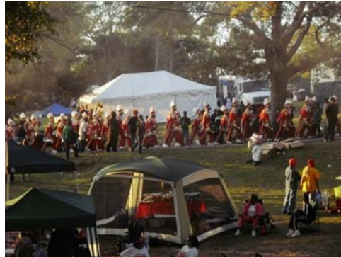
Tuskegee University's Crimson Piper Band marches through tailgaters