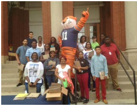
Left: Students returning from the campus tour with valuable information provided by Auburn University.