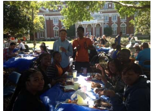
Right: TRiO participants enjoying lunch on the Comer Hall lawn with Auburn students, faculty and staff.