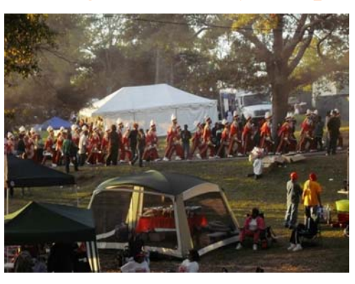
Tuskegee University's Crimson Piper Band marches through tailgaters