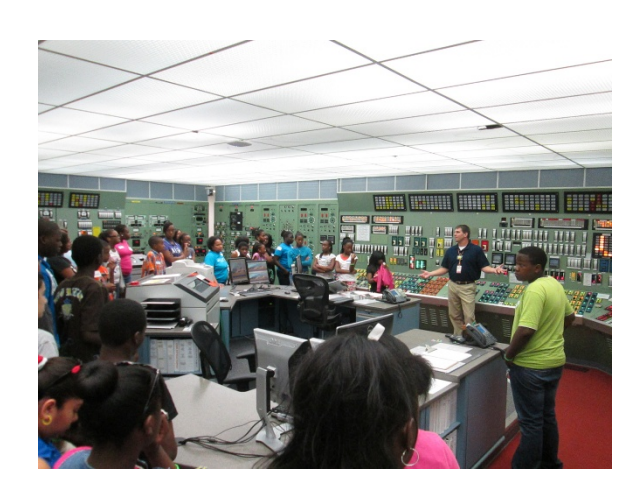
Middle school Talent Search participants learn about the role of engineers while visiting a control room at Farley Nuclear Plant.