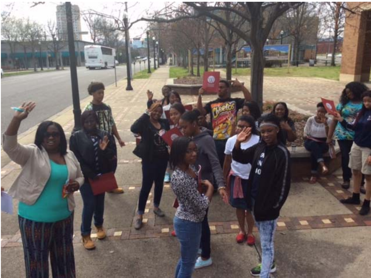
Upward Bound Visits Miles College and the University of Alabama at Birmingham