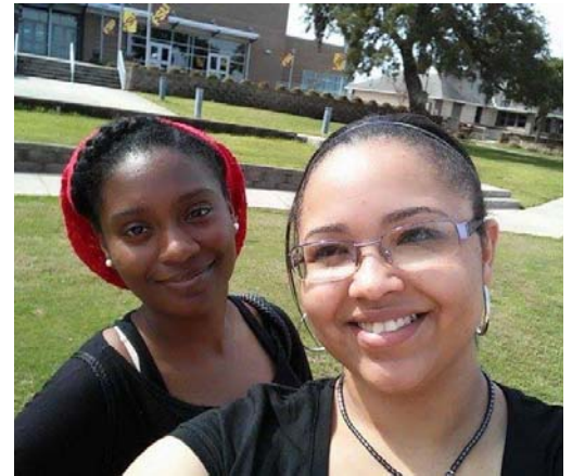
TRiO participants visiting FSU at Panama City