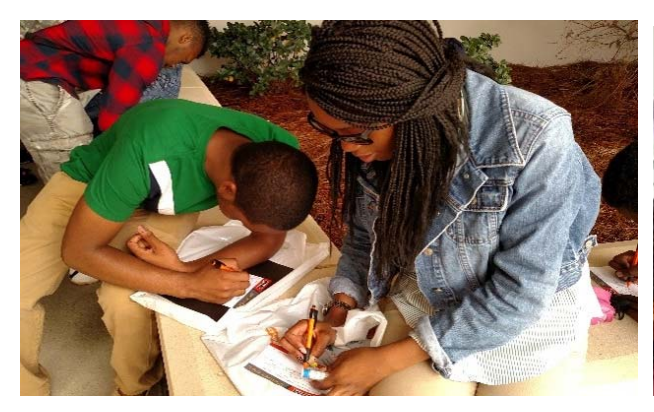
Ninth and tenth-grade Talent Search participants from Eufaula High School complete contact cards at Auburn University at Montgomery.

TRIO Educational Talent Search at WCC has been busy with numerous cultural enrichment activities recently. Talent Search participants have visited colleges and universities as well as Landmark Park in Dothan. On several of the college tours current participants interacted with former Talent Search participants who are now attending the universities that were visited.