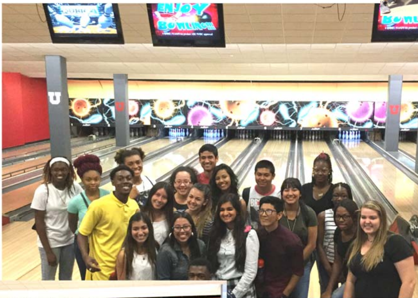
Bowling at the University of Utah with the Utah Jump Start Group