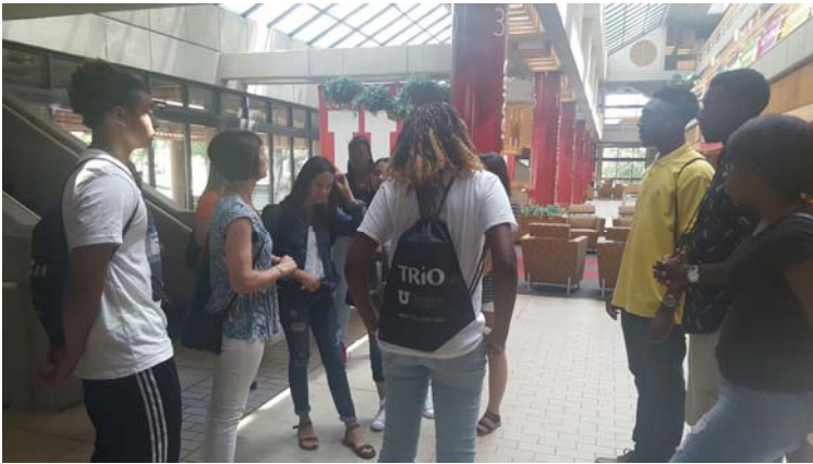
Upward Bound students tour the University of Utah.