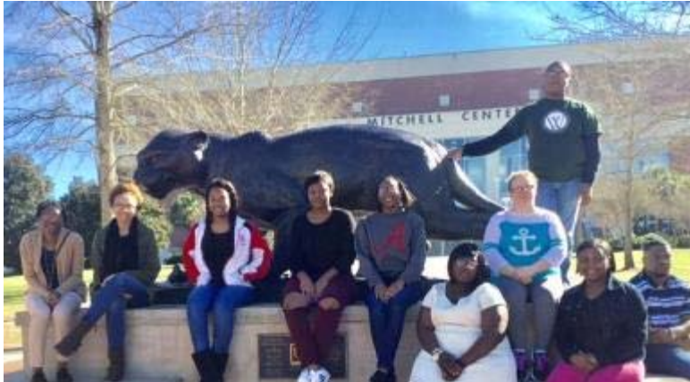
University of South Alabama