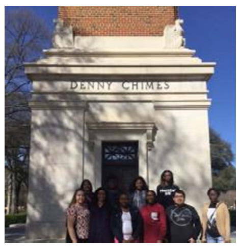
University of Alabama, Tuscaloosa