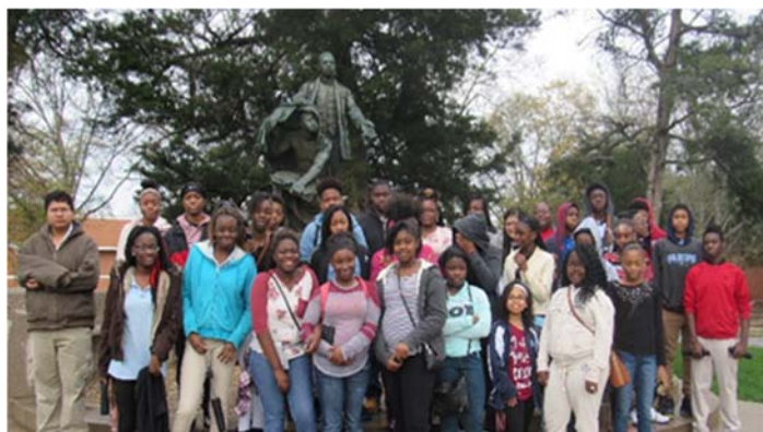
Barbour County High School Seventh and Eighth Graders