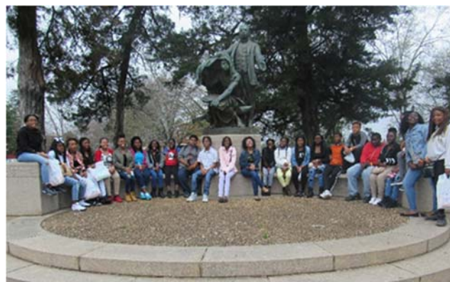
Admiral Moorer Middle School Eighth Graders

Barbour County seventh and eighth graders and Admiral Moorer Middle School eighth graders recently enjoyed a campus tour of Tuskegee University. During the tour Talent Search participants learned about the history of Tuskegee University, college majors, and student life.