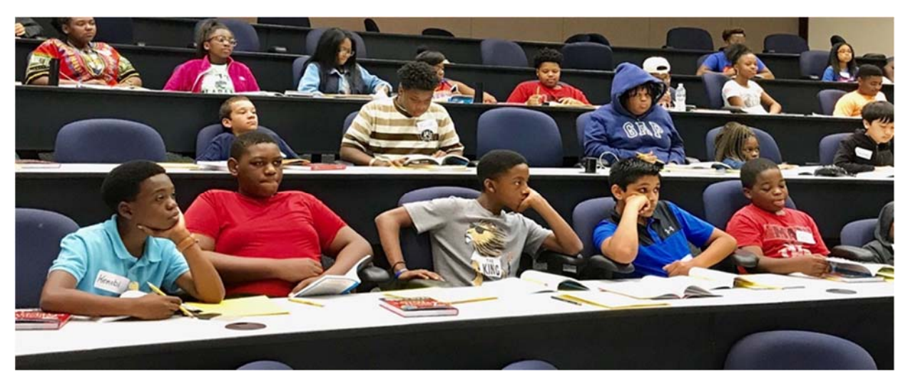
Middle school participants listen attentively as they learn about one of the "7 Habits of Highly Effective Teens."

The summer months do not have to be a season of boredom and mental atrophy. During two weeks in June, TRiO Educational Talent Search held its annual Summer Enrichment program to engage participants in keeping their minds active and focused on college while having fun. Over one hundred middle and high school students attended two learning events.