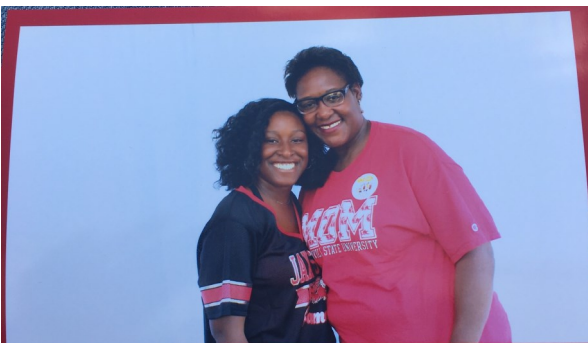
JSU Family Day 09.22.2018

My first semester at Jacksonville State University can be described in two words, "an adjustment". When I started to get ready to transfer from Wallace I was excited. As it started to get closer to time to transfer to JSU learning about a new campus made me a little nervous. When I got to JSU I had to adjust to the campus life and the classes. I had to find out what worked for me with study habits and with finding what made me