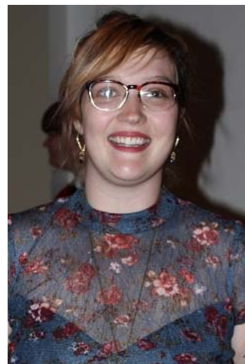
Katherine Murray Art Award