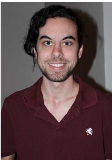
Dexter Pilcher Photographer, Wallace Theatre