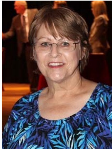
Loma Dempsey Criminal Justice Award