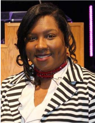
Tanya Hicks Criminal Justice Award