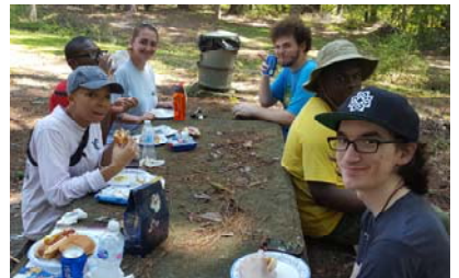
Lunch, the best part of the day!