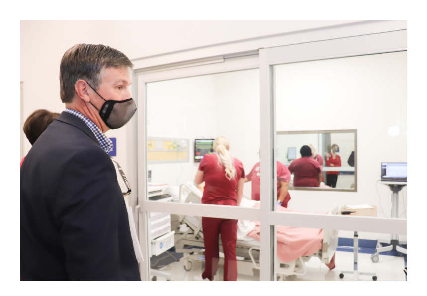
US Congressman Barry Moore tours the Simulation Center in the Heersink Health Science Building

Based on the 2020 Census data, Alabama lawmakers were tasked with drawing new lines for seven Congressional districts, eight State Board of Education districts, 35 Alabama Senate districts, and 105 Alabama House districts.