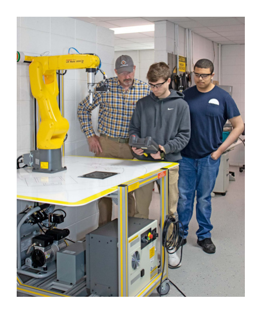
Applied Engineering students on the Sparks Campus in Eufaula at work in the classroom

WCCD was awarded a grant from the Alabama Community College System's Workforce Development Division in the amount of $245,297.60 for the College's Applied Engineering Technology Program. The grant will provide funding for new lab equipment and simulation software to be incorporated into the existing Applied Engineering Technology program on both the Wallace Campus in Dothan and the Sparks Campus in Eufaula.