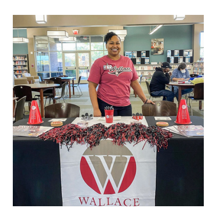
The Lumina Foundation grant will enhance the Wallace on Wheels program

Wallace Community College-Dothan (WCCD) was awarded a $75,000 grant from Lumina Foundation to further its efforts to increase adult student enrollment in credit and non-credit programs. WCCD was one of only 20 community colleges in the nation and one of two community colleges in Alabama chosen to receive funding.