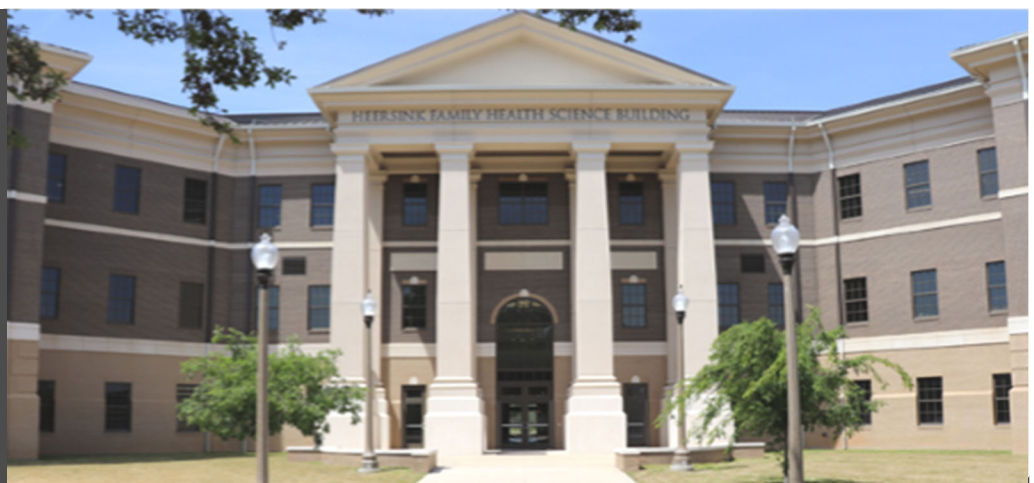
Heersink Family Health Science Building